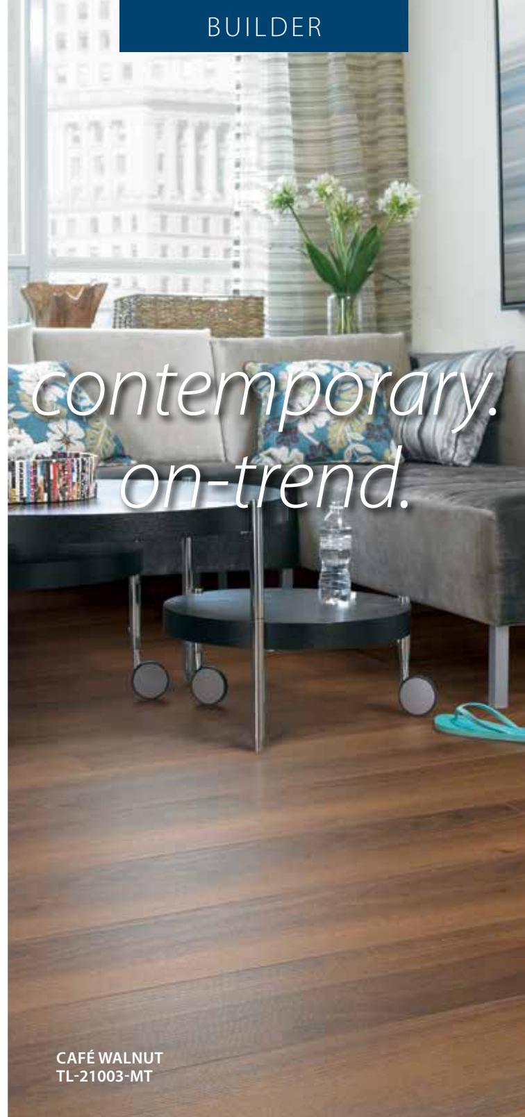
CAFÉ WALNUT TL-21003-MT