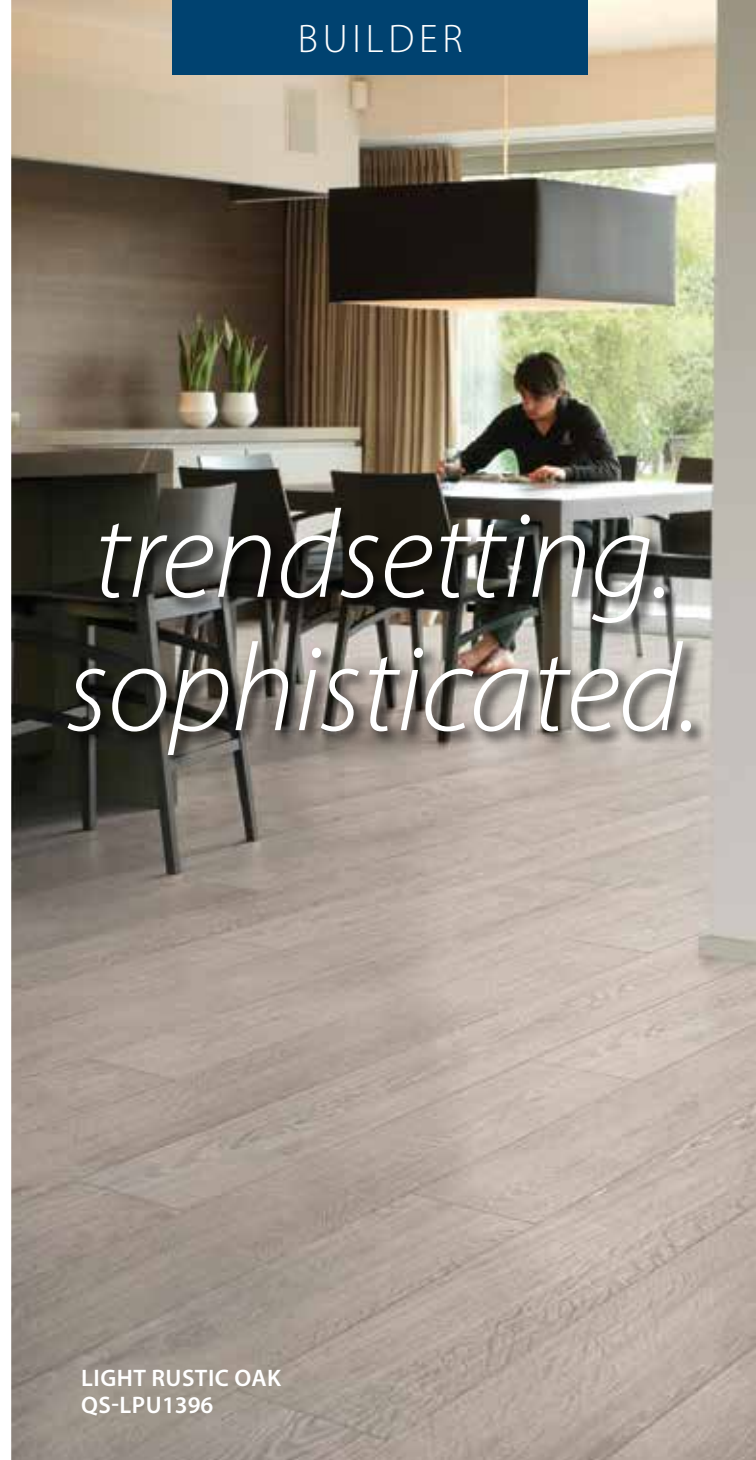
LIGHT RUSTIC OAK QS-LPU1396